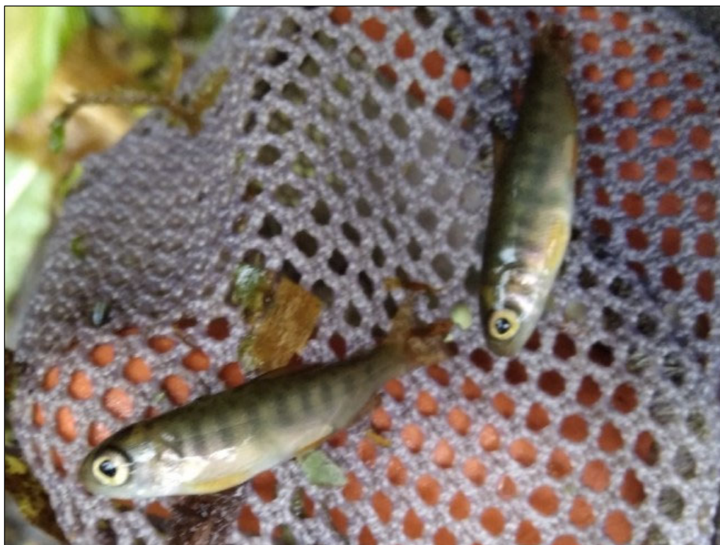
Figure 1.—Juvenile coho salmon captured at waypoint 913.