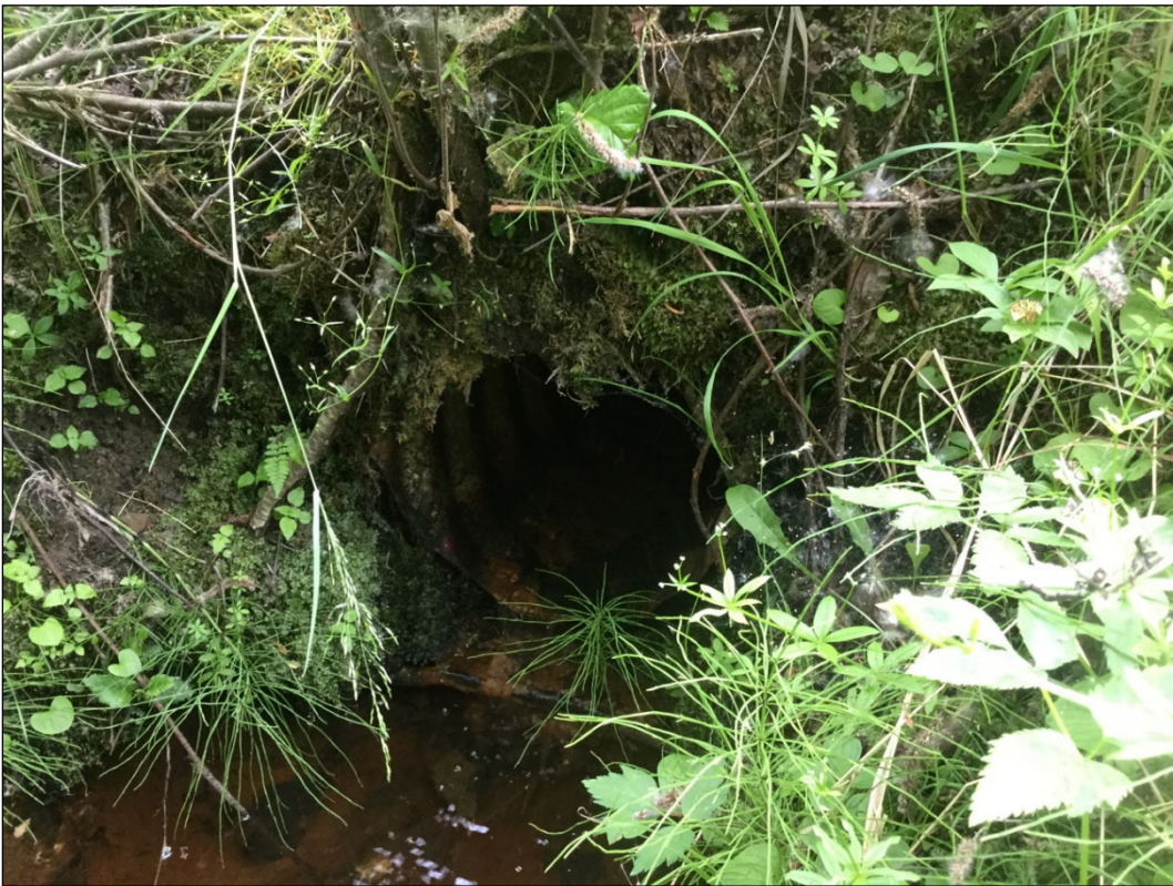
Figure 3.—Culvert outlet at waypoint 913.