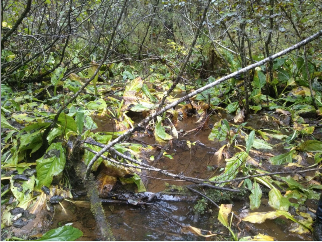
Figure 2.—Channel at waypoint 913.